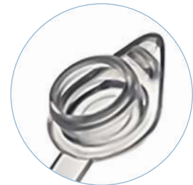
With Safe Lock 60-0288