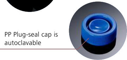
PP Plug-seal cap is autoclavable