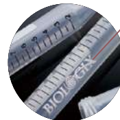
Black graduation marks