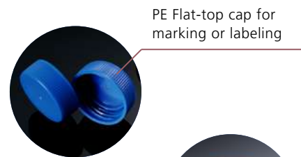
PE Flat-top cap for marking or labeling